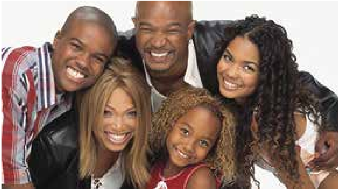
My Wife and Kids (2001 – 05)

The Black family sitcom has gone through ebbs and flows over the years. Between the sophisticated Blackness of The Cosby Show and the sociopolitical rhetoric of Black-ish , there are the working middle class Kyles of My Wife and Kids . This quirky family comedy takes the Cosby appeal and adds hilarious gags and Millennial children into the mix. It manages to tackle everyday issues like teen pregnancy and family strife with hilarity and heart. Jay and Michael's approach to child-rearing falls more in line with what a Black American family is like.