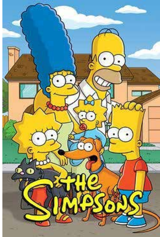
The Simpsons (1989 – present)

This cultural phenomenon enters its thirtieth season as the blueprint of today's adult-oriented animation ( South Park , Family Guy , Bob's Burgers ). Despite some decline in quality since its 1980's and 1990's heyday, the animated sitcom continues to skewer American pop culture and society on a weekly basis from the town of Springfield. Its mix of satire, top-notch voice talent and quality animation has the series consistently rated amongst the best-animated series. Bart, Homer, Marge, Lisa and the citizens of Springfield are ingrained in pop culture. I mean it's not the longest-running sitcom, animated series and primetime series for no reason.