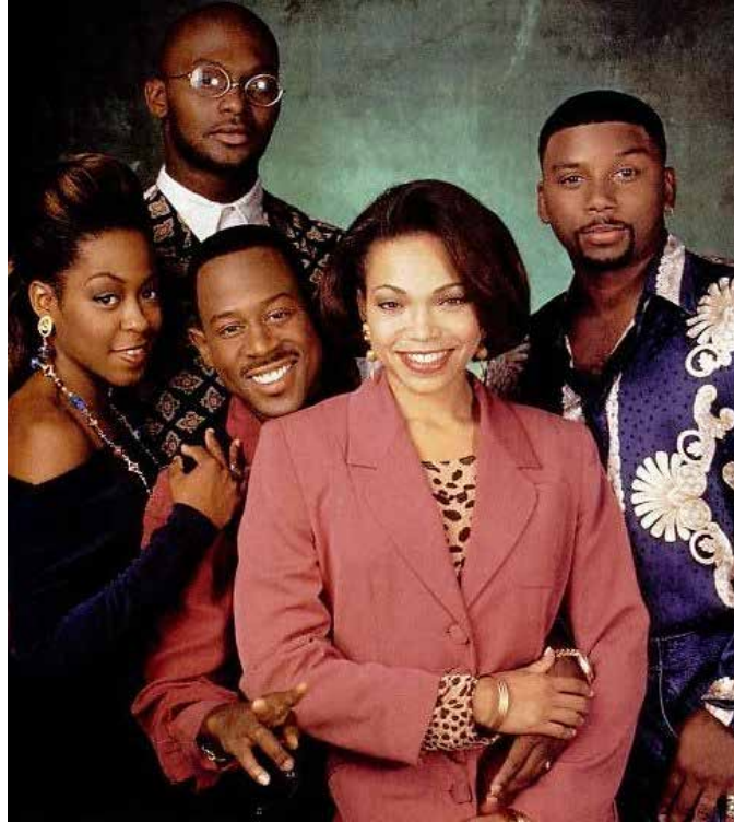
Martin (1992 – 97)

This celebrated 1990's sitcom blends the Def Comedy Jam humor star Martin Lawrence with the diverse hip-hop culture of its day. Each character in the series is different in every way (skin tone, personality, quirks) giving a diverse range of the black experience with hilarity (despite some hints of colorism). Martin and his crew's hijinks, gags and social commentary are still potent in Black culture with references scattered throughout today's hip-hop culture.