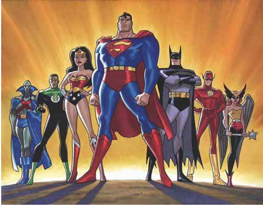
Justice League/Justice League Unlimited (2001 – 06)

Within the superhero genre, this mature and layered animated series is still much-talked and celebrated amongst many animation enthusiasts and fans. The series gives the animated medium a much-needed dose of diversity with strong, multi-dimensional characters of color in major roles. The series mixes serialized storytelling, mature themes and issues and dark subject matter to create a complicated and dynamic entry in the overall animation canon. Watching John Stewart and Martian Manhunter fight with Justice League is amazing to watch. This series is a great way to get teens and young adults into the genre.