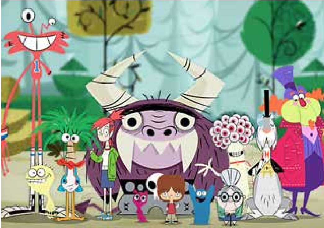
Foster's Home for Imaginary Friends (2004 – 09)

With the content Cartoon Network is churning out today, the network is a disciple for quirky and interesting animated series for all ages. This Craig McCracken quirky family comedy falls right in line with that philosophy. The child-like designs blend seamlessly with outrageous storylines and top-notch animation. It does a great job of putting the medicine in the candy when it comes to life lessons. Watching Mac and Frankie deal with a zany cast of imaginary friends is a treat for any kid at heart.