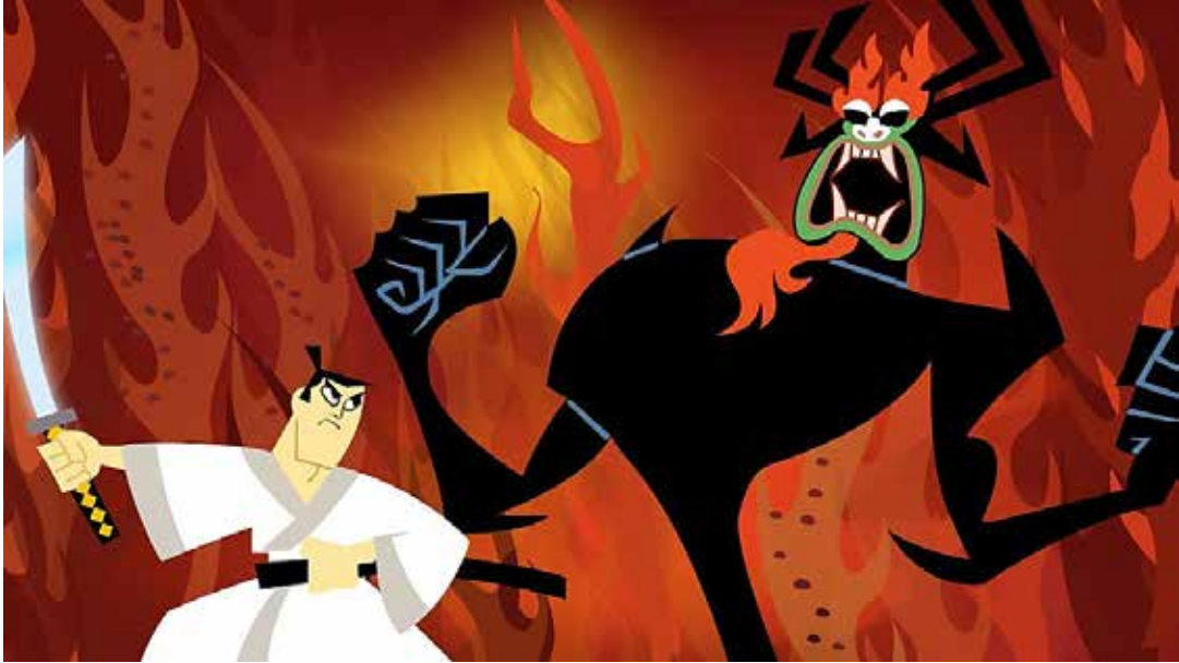
Samurai Jack (2001 – 04, 2017)

Another off-beat series from Cartoon Network's early canon is this Genndy Tartakovsky action dramedy. Mixing old Japanese samurai films, spaghetti westerns and over-the-top action is a hallmark of the series as Jack takes revenge on his nemesis Aku and his many underlings. The series balances light comedic moments with dark, intense action and drama with an effortless appeal. The series is a must for any action head with an animation infatuation.